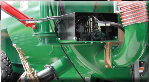
Electric Hydraulic Valve Bank