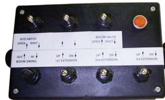
Electric Over Hydraulic Finger Tip Controller