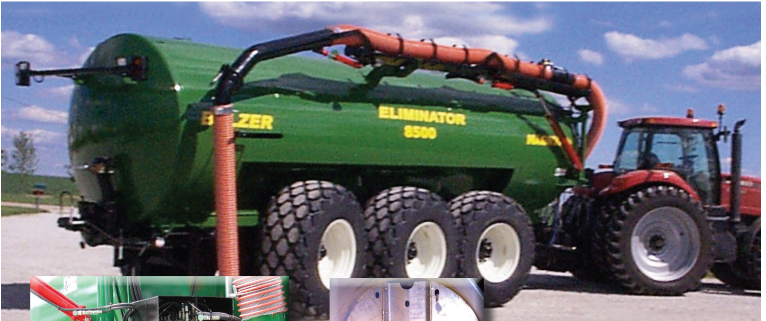
8500 Tridem Gear Steer Eliminator