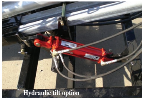
Hydraulic tilt option

Heavy duty gear box is available in 540 or 1000 RPM. Full 2 year warranty on all gear boxes.